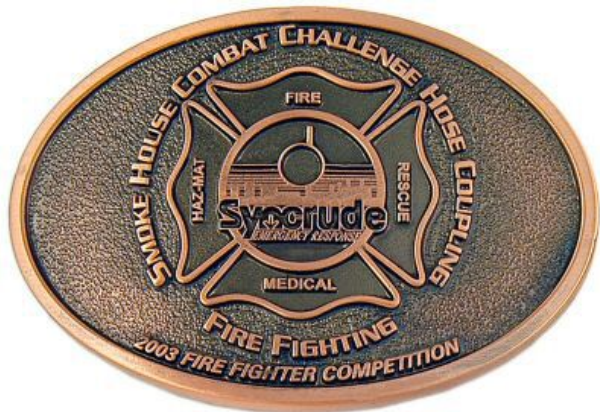
Sample of Standard 2 Level