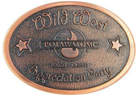
Sample Zinc Buckle - Antique Copper Finish